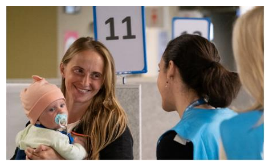
UNHCR staff assist refugees from Ukraine at UNHCR's cash enrolment centre in Krakow's Tauron Arena in Poland.