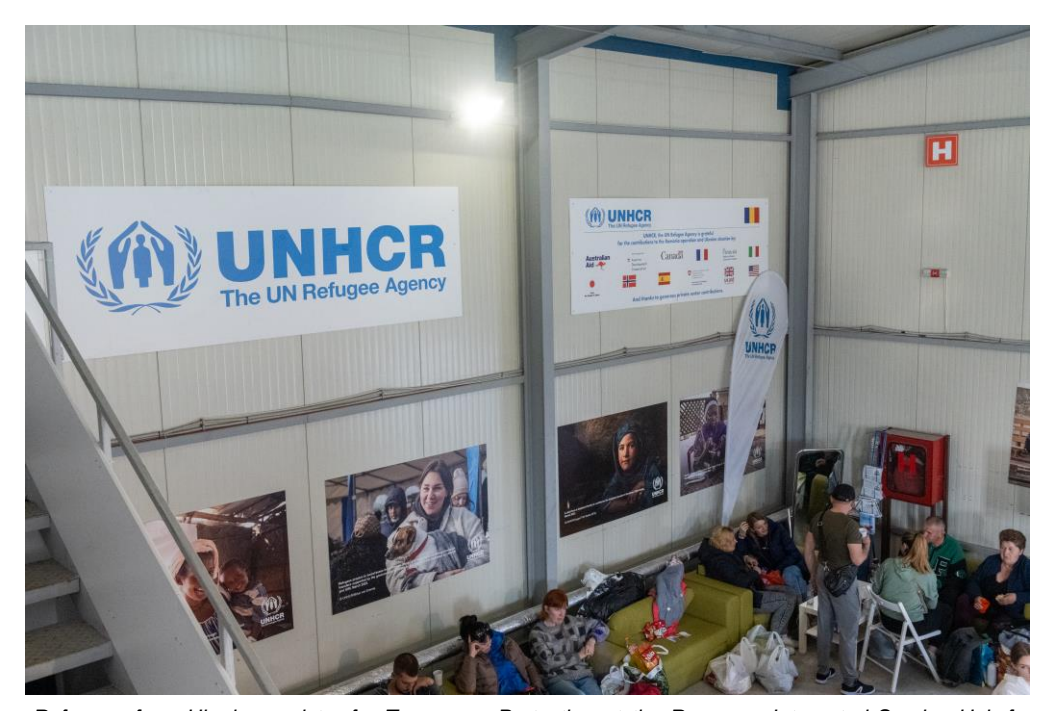
Refugees from Ukraine register for Temporary Protection at the Romexpo Integrated Service Hub for refugees, established by UNHCR in Bucharest, 20 December 2022.